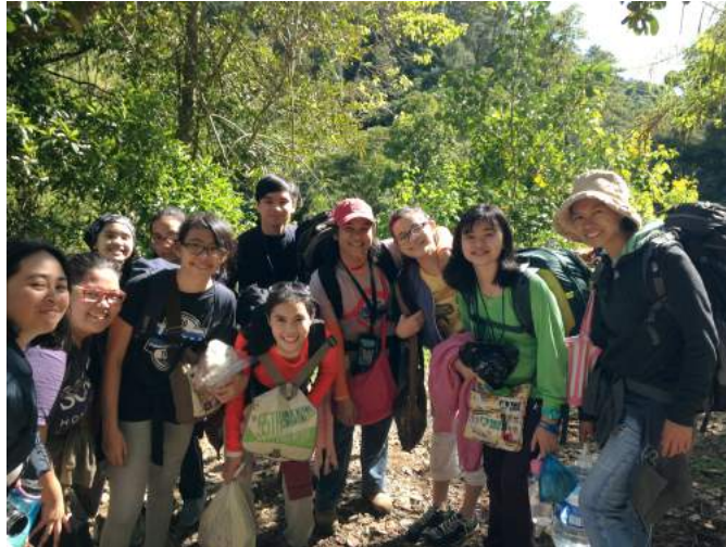
(Laren students and staff at ENCA Farm, November 2014)

Environmental Education Program: Since 2011, students from the Laren Montessori School in Manila have visited ENCA Farm as part of their field school curriculum. What started as two students has grown to nearly fifteen who visited ENCA Farm twice this calendar year. These students reside on the farm to learn about organic farming and environmental conservation.