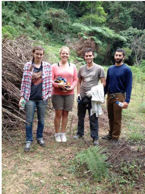
(WWOOFing Volunteers from around the globe, Israel, US, and Germany at ENCA)