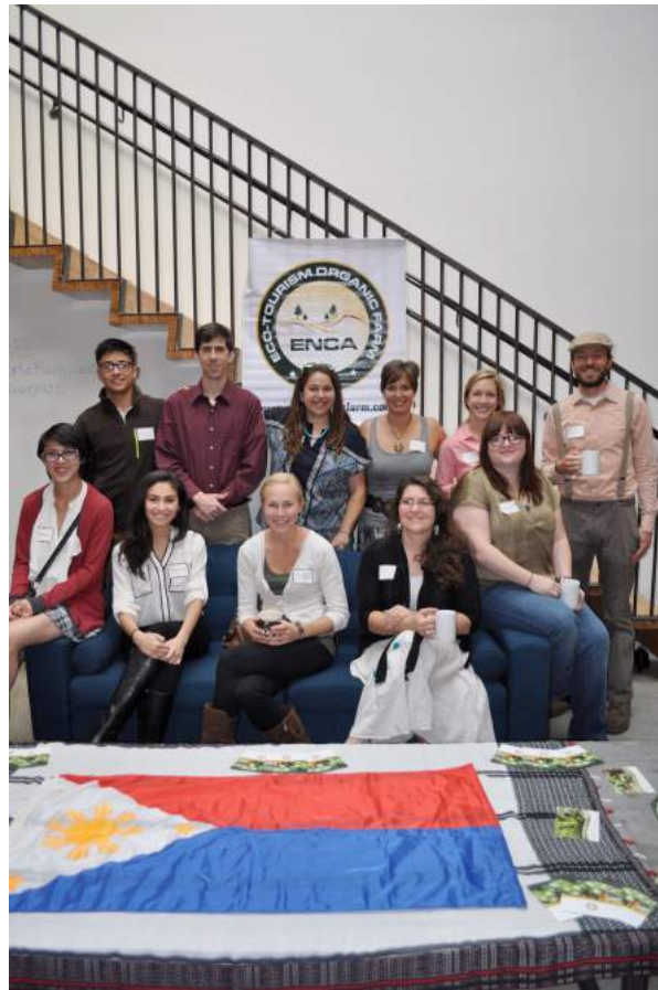
(Friends of ENCA Farm volunteers at 4 th Annual Nourish event October 2014)